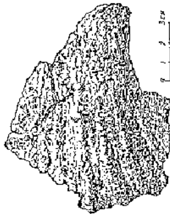
Fig. 3. Talarurus plicatospineus gen. et sp. nov. Spine of the armor.

Moving on to the systematic position of the Baynshirenian armored dinosaurs, it should first be noted that our form is a typical representative of the suborder Ankylosauria in the character of the structure of its skull, axial skeleton, girdles, extremities, and armor. Heavy armor, great sacralization of the spinal column (9 vertebrae), and the ankylosis of ribs with the transverse processes of the vertebrae - determine it being a representative of the family Ankylosauridae (5). Among the most completely known Cretaceous ankylosaurids ( Polacanthus , Palaeoscincus (6), Panoplosaurus (7), Scolosaurus (7), Dyoplosaurus (8), Euplocephalus (5), Ankylosaurus (5)), the genus Ankylosaurus B. Brown (1908) known from the middle and upper horizons of the Upper Cretaceous of U.S.A. - Lance Formation, Hell Creek beds, Montana, Edmonton, Alberta (5) - is most closely allied to the here described form in the structure of the skull, postcranial skeleton, and armor. Our form differs, however, from